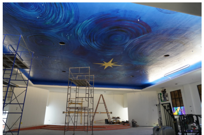
Mural progress as of September 26, 2025