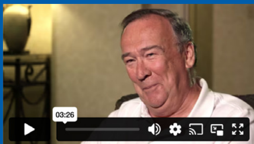
"I Can Tell Him Anything"